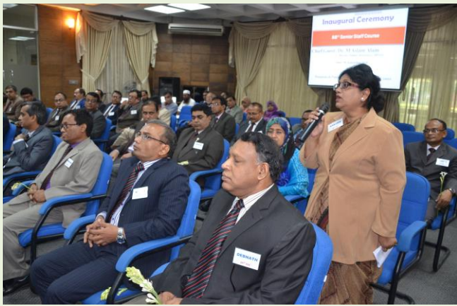
Participants of 88 th SSC Presented a Self Introduction during the Inaugural Ceremony of the Course on 18 September 2018