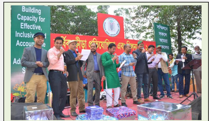
Young Faculty Members of BPATC Performed at the Cultural Events of 'Annual Sports Competition and Picnic 2018' on 7 December 2018.