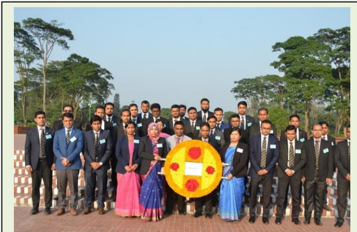
Participants of 6th SFTC for DoR Officials Along with the Members of Course Management Payed Tribute at the National