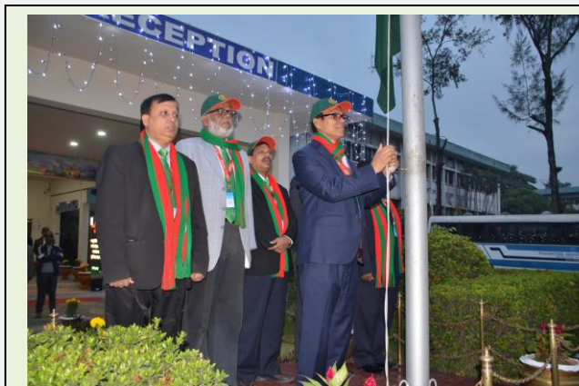
The Victory Day Programme Began with the Hoisting of the National Flag by the Rector (Senior Secretary) BPATC. MDSs of BPATC were also with the Rector.

BPATC payed deep tribute to the martyrs of the nation on the 16 th December 2018 by observing the Victory Day of Bangladesh. In observance of the day BPATC hoisted the National Flag at half-mast.