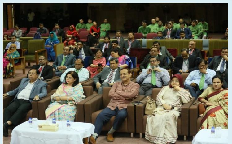
Participants of 1 st Policy Dialogue along with the Faculty Members of BPATC and Participants of 67 th FTC Enjoyed the Cultural Evening Organised on 12 October 2018

Overall, it was a fruitful dialogue. Feedback from guests, panelist as well as from the participants was very much satisfactory. After the successful completion of 1 st Policy Dialogue BPATC is looking forward to planning for next episode of policy dialogue in near future.