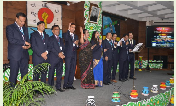
Participants of 122 nd ACAD Performed Cultural Events in the Guest Night of the Course