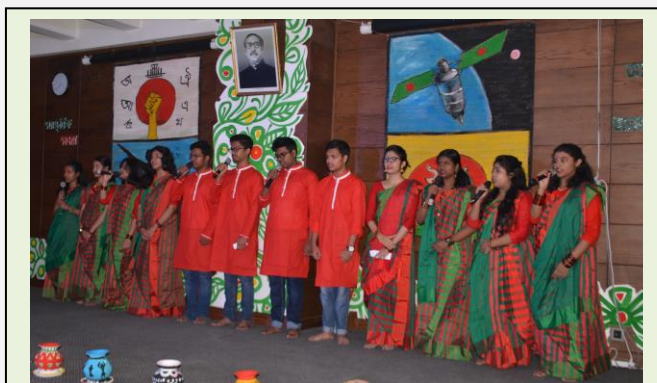
The Students of BPATC School & Colleges Staged a Cultural Performance that Colored the Event of 2 nd Policy Dialogue

Beyond academic segment special arrangements (games, boat riding etc.) were organized for spouses of the participants. Special cultural event by the students of BPATC School & Colleges added extra color to the event. Feedback from the Guests and Participants was highly satisfactory that encourages BPATC to organize such kind of programme in coming days.